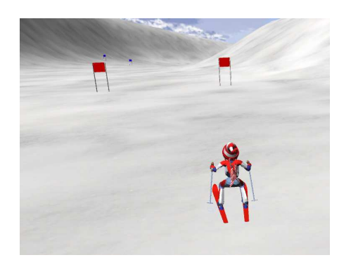
Figure 1: A screenshot of the ReSkii game.

other hand, very few studies investigate the design of adaptive mechanisms for maximizing player experience in such augmented-reality game platforms [16].