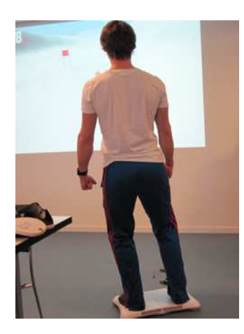
Figure 3: Control subject playing ReSkii.