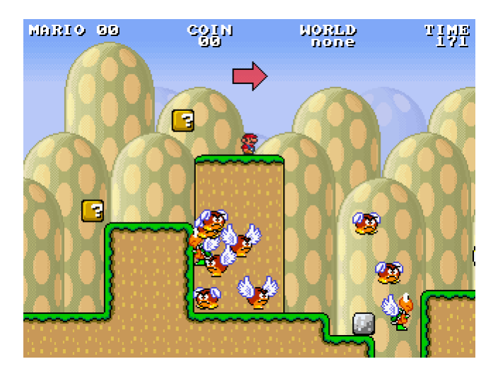
Figure 3: Enemies created in response to coins collected.

play for most subjects. In fact, unless told so, most players did not realize that the second level was created based on their own actions in the previous level. Some players remarked that the first level was boring, and subsequent levels were strange and often unpredictable, with easy segments mixed up with very hard segments.