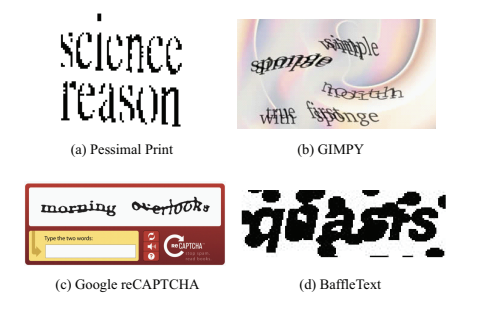
Figure 1: Examples of visual CAPTCHA.