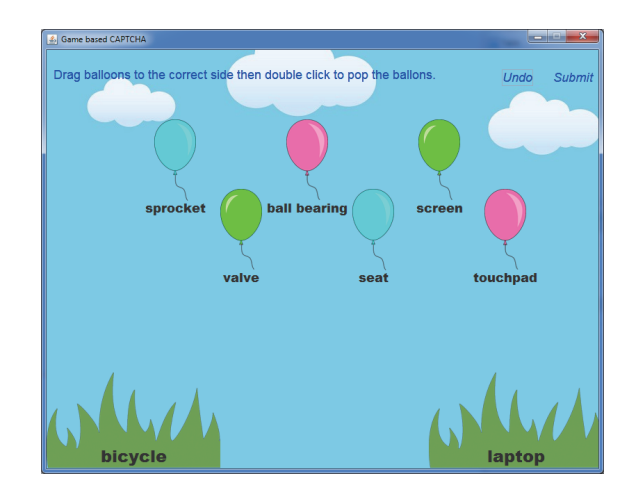
Figure 4: A screenshot of a preliminary game-based CAPTCHA.

We have built a preliminary implementation for the AGCG system. At current stage, the AGCG is capable of retrieving the commonsense knowledge from ConceptNet, choosing unknown component concepts using SimRank, and creating the game-based CAPTCHAs with a template. Figure 4 shows a screen shot of one of the generated CAPTCHAs. In Figure 4, the CAPTCHA shows two test concepts: bicycle and laptop